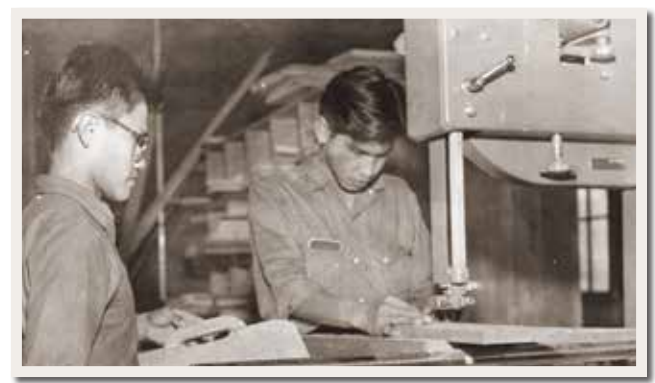
PHOTO: Carpentry shop, Kamloops Indian Residential School, 1958-59. Basil Fox Library and Archives Canada / PA-185-652