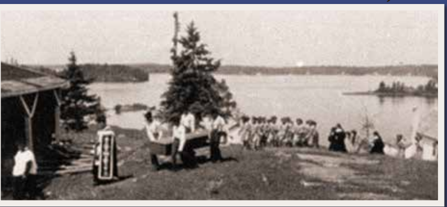
PHOTO: Funeral procession, Kenora, Ontario 1941.

Working with Survivors and Aboriginal organizations, the TRC's Missing Children Project is documenting the deaths and the burial places of children who died while attending a residential school. To date, the TRC has identifed the names of, or information about, more than 3000 childern who died of disease or accident.