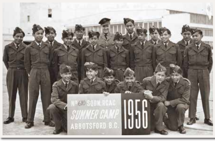
PHOTO: No. 610 Squadron Royal Canadian Air Cadets Summer Camp, Abbotsford, BC, 1956