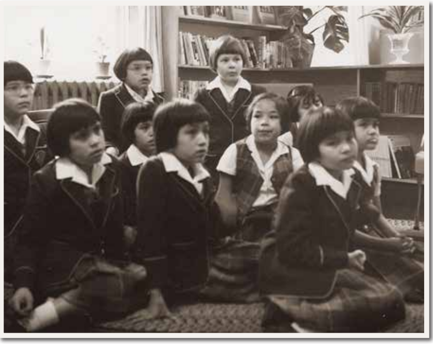
PHOTO: Alert Bay Mission School, 1885.